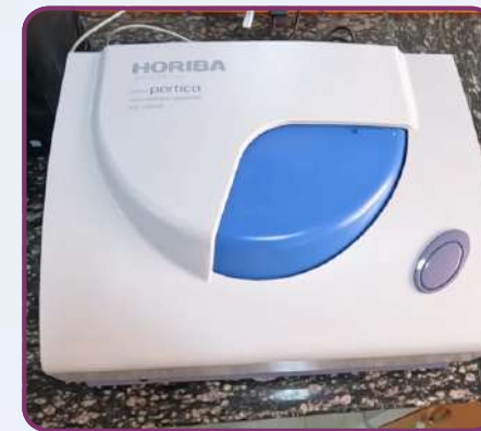
Nanoparticle Tracking Analyser