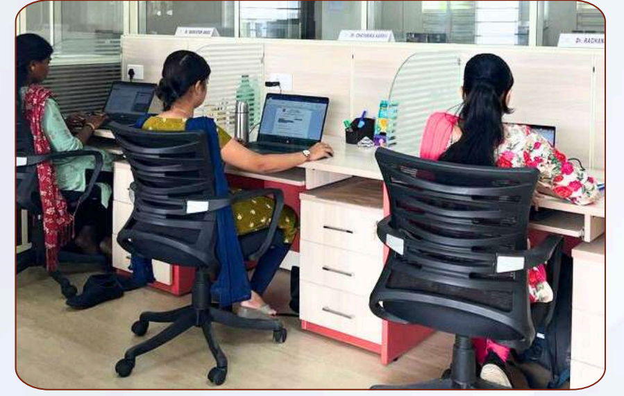
Innovation fellows workspace