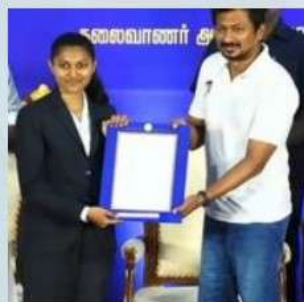
BBA 2022 Batch - Recd. Govt. posting in GST Sector