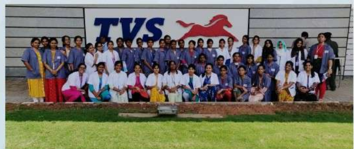
Industry Visit - TVS Motor Company, Hosur